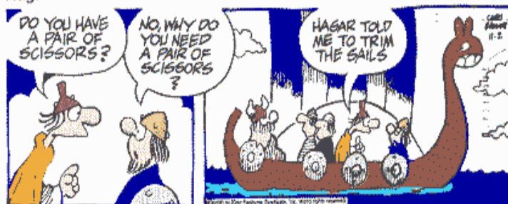
Hagar the Horrible