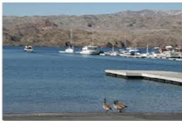
Katherine's Landing, Lake Mohave

Katherine Landing Lake Mohave, Arizona April 20-22, 2012