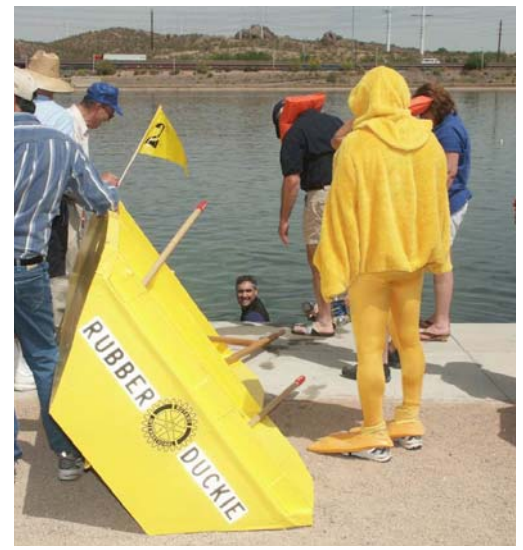
Everyone's favorite Rubber Ducky...