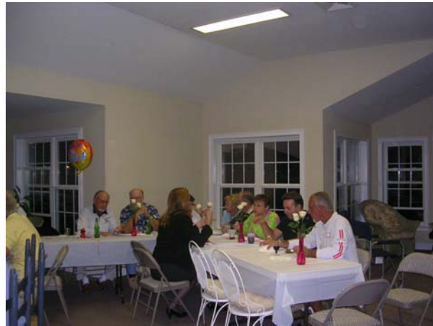
Cmdrs. Appreciation Dinner