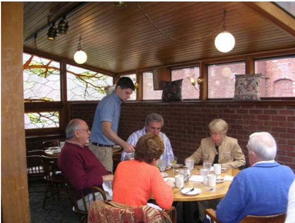
Change of Watch 2008