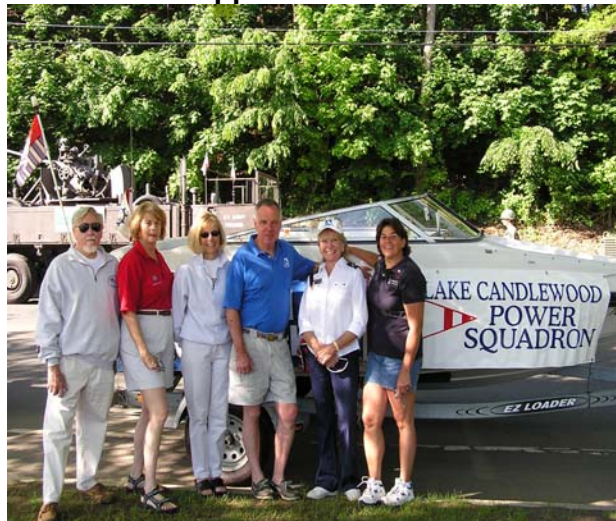
Memorial Day Parade