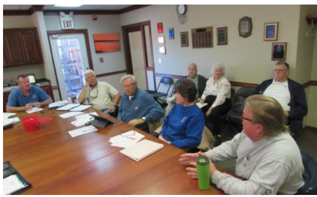
The Eboard gets down to work after a fun weekend with the Squadron Christmas Party and Grove Christmas Parade.