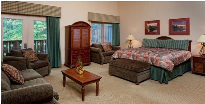
Lodge King Room

Inn rooms are standard size rooms. Lodge rooms are large well appointed rooms living area and kitchen. See pictures.