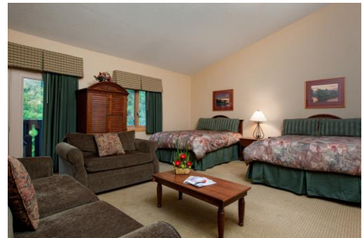
Lodge Queen Room