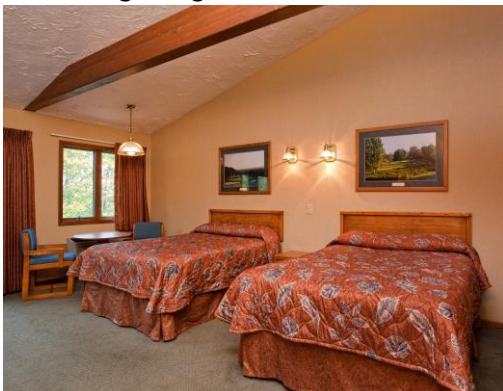
Inn Standard Room