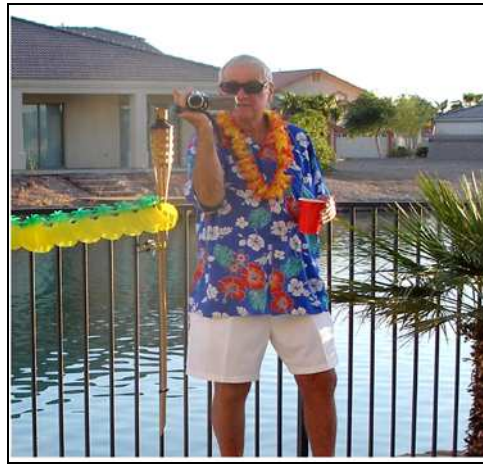
Norm Dack, Our Official Photographer