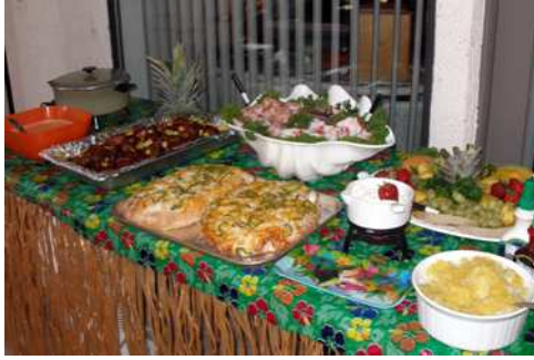
Where Is The Poi?