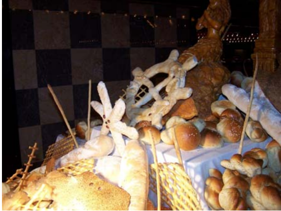
Food Art displayed at the midnight buffet.