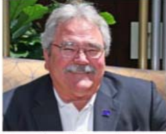
"QUICK DRAW" PRICE

RUTHLESS MEMBERS OF THE SOUTH TEXAS FIVE. THOUGHT TO BE ILLEGALLY KEEPIN' PORPOISES AS PETS. "QUICK DRAW" IS KNOWN TO BE BUYIN' BLACK MARKET WHOOPIN' CRANES TO FEED SAID PETS. "THE HACKER" IS WANTED FOR TRAFFICIN' ENDANGERED SPECIES FOR ILLEGAL PORPOISES.