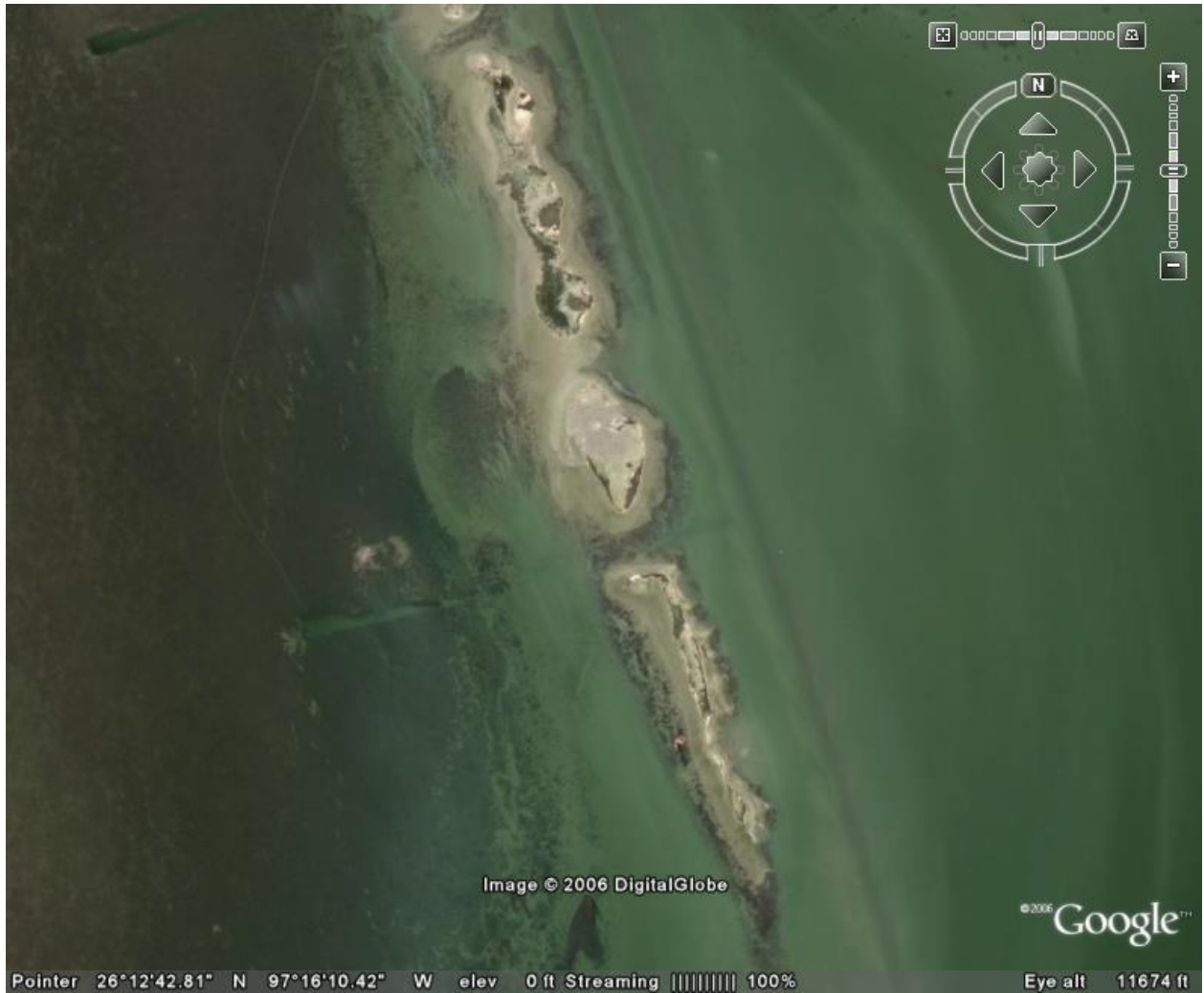
Spoil banks that were vegetated.