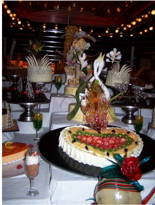
Beautiful displays created with food.