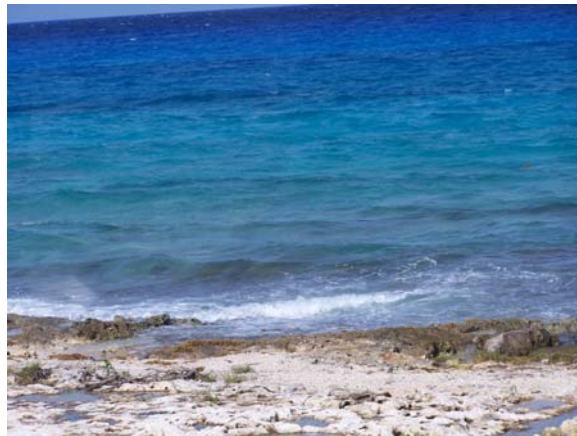
Water colors of blue that are hard to describe.