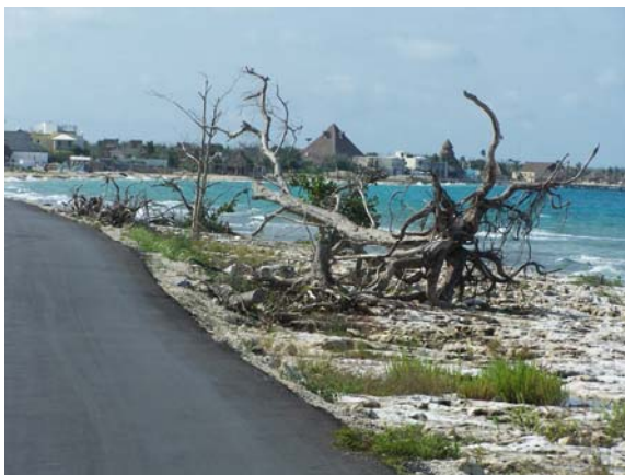
Vegetation damage from Cat-5 Wilma remains on much of the island. A lot of building structures are already repaired, or are under repair, while a few are still waiting their turn.