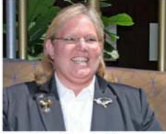
"THE HACKER" POLT

DISTRICT 21 SHERIFF'S DEPARTMENT OF CONFERENCE ATTENDANCE ENFORCEMENT