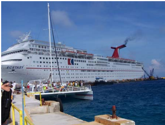
Cruise Ship Ecstasy docked in Cozumel.