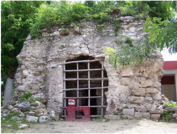
Ancient Mayan Tempel on Cozumel.