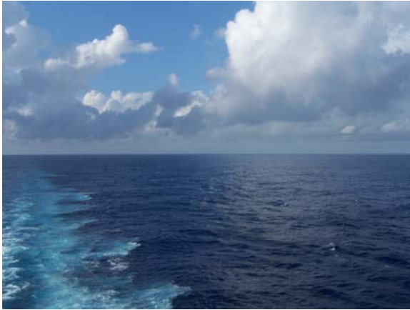
On the sapphire blue waters of the Gulf.