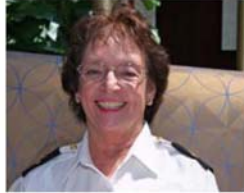
"WHOA NELLIE" MOORE

"WHOA NELLIE" WAS CONVICTED OF EATIN' FAST FOOD IN THE HOLY CONFINES OF THE ALAMO LAST YEAR. SHE ESCAPED WITH THE ASSISTANCE OF "THE POSSUM", A KNOWN CAT RUSTLER. BOTH ARE WANTED FOR SQUARE DANCIN' AFTER DARK WITH SMALL ANIMALS WITHOUT A PERMIT.