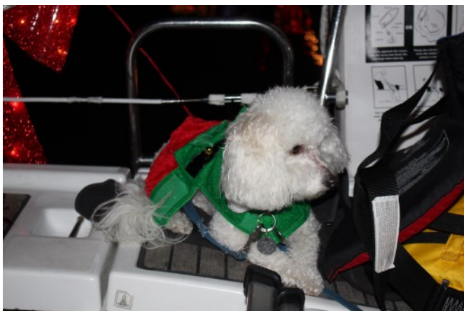
"Petey" dresses up for the parade