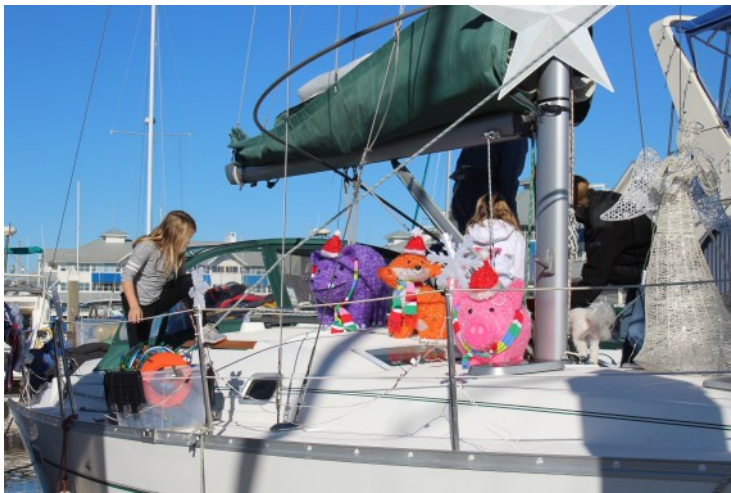
Dressing up "Lucy!"