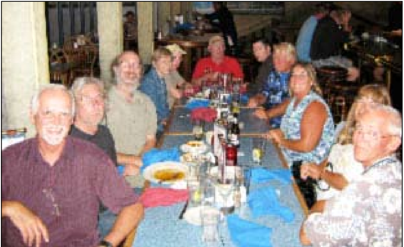
- At the Dana Point Cruise -