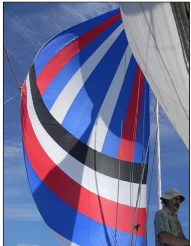
- Spinnaker Time -