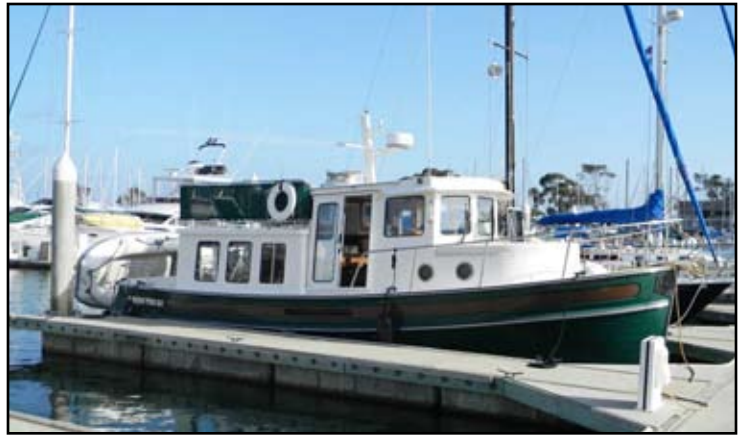
Dana Point Cruise At left; Commander and SEO relax Above: Nordic Star