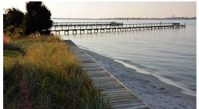
Morehead City Water View