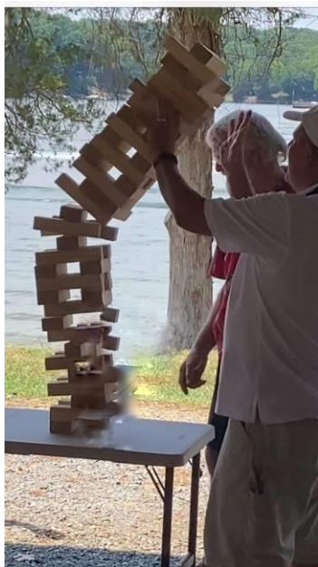
This picture captures the last second topple that cinched the team competition for Team 9.

ABC-Charlotte hosted the D/27 Rendezvous at the Red Fez Club on Lake Wylie, and the Cambria Hotel and Carolina Ale House in the Kingsley area of Fort Mill over the June 24-25 weekend. It was a great success. Eight different squadrons from the district were represented, with 32 attending the Friday night reception, 45 attending the picnic on Saturday, and 29 attending the farewell reception on Saturday night. If you couldn't make it, you really missed a fantastic event.