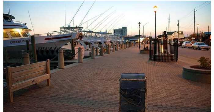
Morehead City Waterfront

Morehead City is a port town in Carteret County, North Carolina, United States. The population was 8,661 at the 2010 census. Morehead City celebrated the 150th anniversary of its founding on May 5, 2007. It forms part of the Crystal Coast.