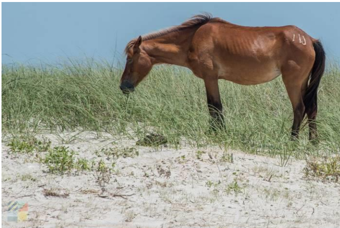
Shackleford Banks Wild Horse