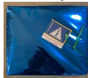
Fabulous Team Competition Prize