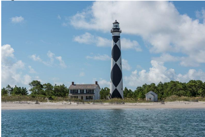
Cape Lookout Lighthouse Near Beaufort

Beaufort is a town in and the county seat of Carteret County, North Carolina, United States. Established in 1713 and incorporated in 1723, Beaufort is the fourth oldest town in North Carolina. On February 1, 2012, Beaufort was ranked as "America's Coolest Small Town" by readers of Budget Travel Magazine.