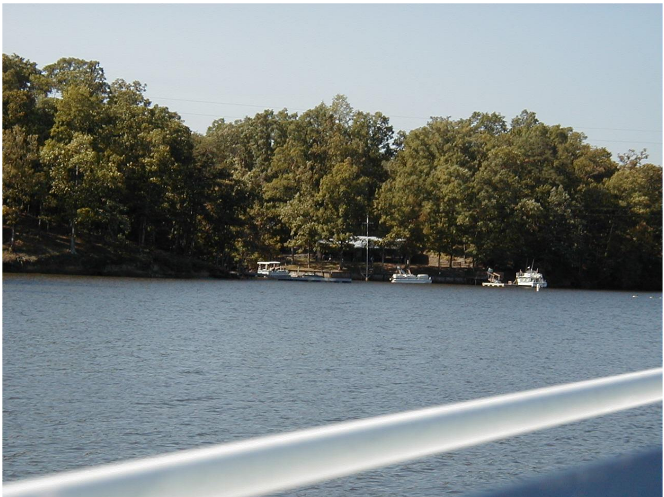
Merit Mark Point September 2000