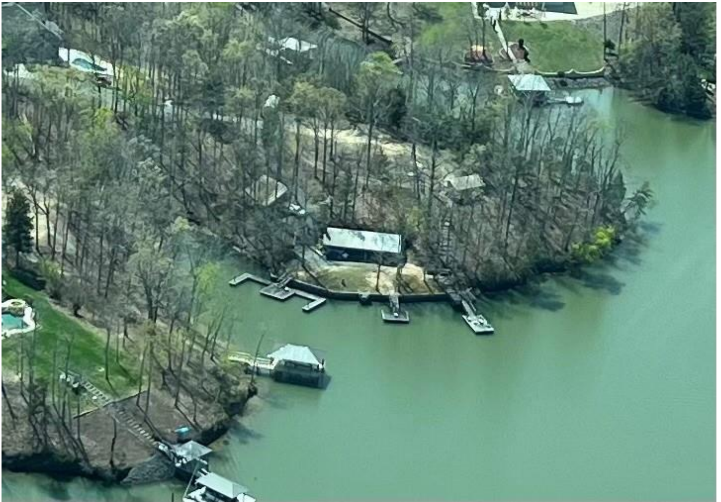
Merit Mark Point By Air