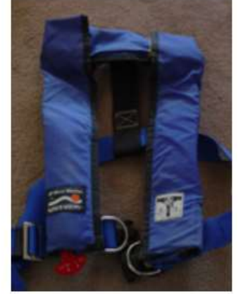
Inflatable PFDs like this SOSpenders version need regular maintenance.

Now that you have dealt with the inflatable PFD's Achilles' Heel, exploit its advantages and wear it whenever you are underway!