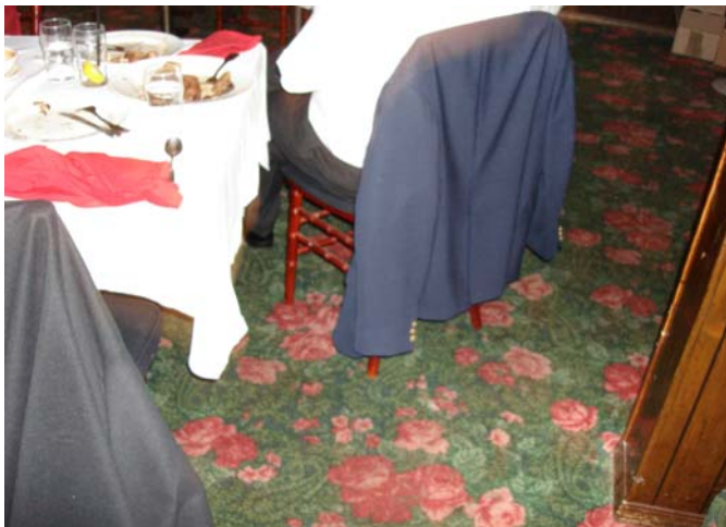
The Far Western has gotta replace this carpet!