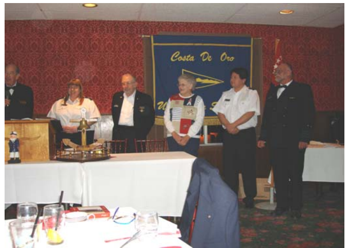
The new CDO Bridge for the 2008-09 Watch