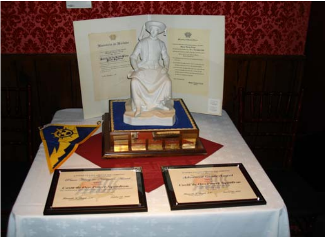
CDO won the Prince Henry the Navigator Trophy (again)