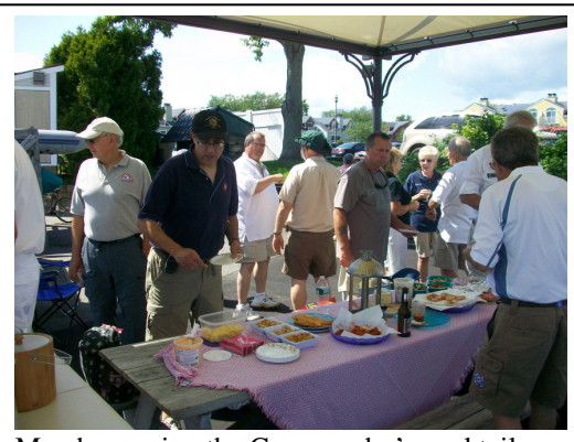
Members enjoy the Commander's cocktail hour. If you own a boat, please come and stay for the weekend, otherwise come on Saturday for an activity filled day and a nice picnic at 1600.

Dockage for boaters: $3.95/ft, shore power $11/30a, $22/50a all per night, includes complimentary cable TV and WiFi. Docking arrangements can be made using their website or call 860-395-3080. State that you are a member of District 1 USPS.