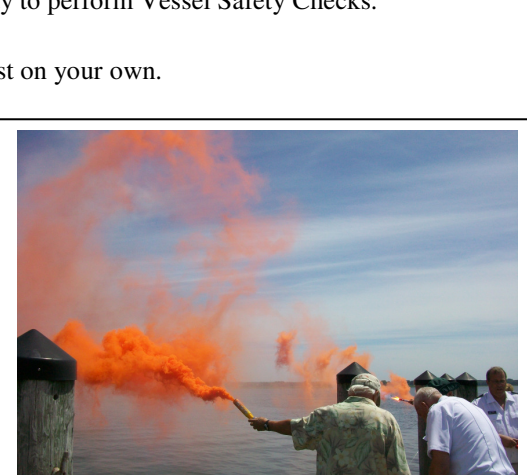
This is your chance to bring some of your old flares and light or shoot them off legally. It's a lot of fun for the older kids and very instructional for the adults. If you don't have any, we have extras. If you have extra old flares bring them for the rest of us.