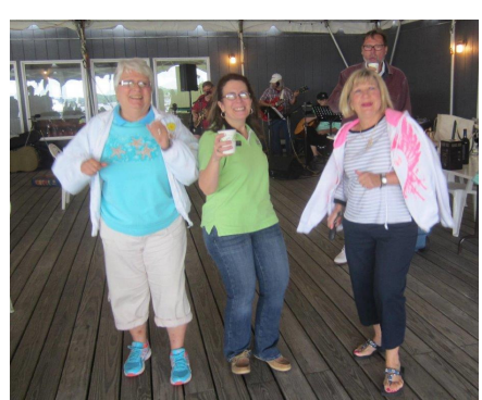
The "RoadRunners" are returning and some may "rock out".