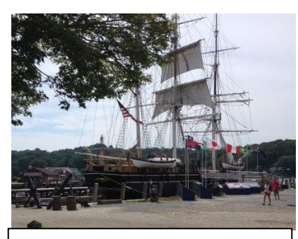
The Charles W. Morgan at rest at Mystic Seaport. 2016 file Photo by Alex McKibbin

District members and guests enjoyed a Mini Cruise to Mystic Seaport on 13-15 July. The docking fee included free entrance to all of the exhibits at the seaport.