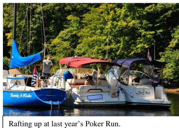
Rafting up at last year's Poker Run.

A Poker Run is an organized event where the objective is to obtain the best poker "hand." A Poker Run is not a race, but a game of