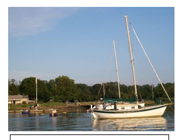
Mattituck Park District dock