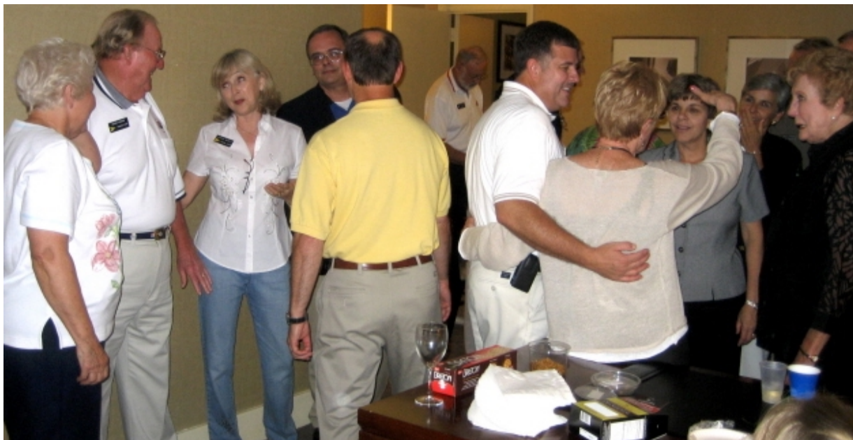
Members of D/15 Partying before the New York GB

Uniform at the Conference meeting for the District Bridge will be USPS uniform G. The uniform for other members and guests will be uniform G or appropriate attire.