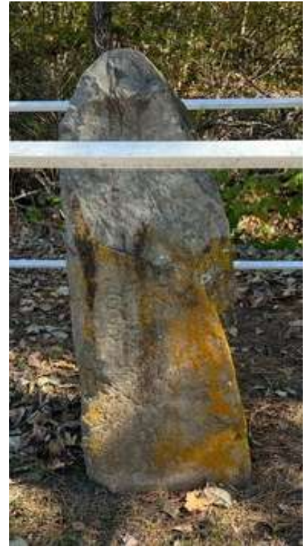
EC1655-Boundary Mon Old North Corner

Many geodetic marks can be found along state borders. The mark on the left was found on the Ohio-Pennsylvania border near Conneaut, OH. It was recovered by members of the Stark County and Vermilion Squadrons/D7. The mark on the right was found on the North Carolina and South Carolina border near Lancaster, SC. It was recovered by members of the Charlotte Power Squadron/D27.