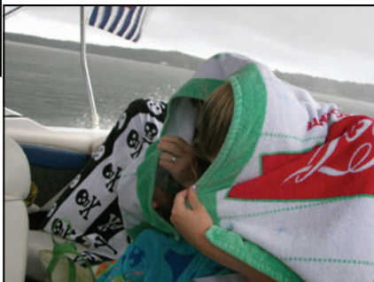
Below: Oh, my! What a lot of wind and rain.