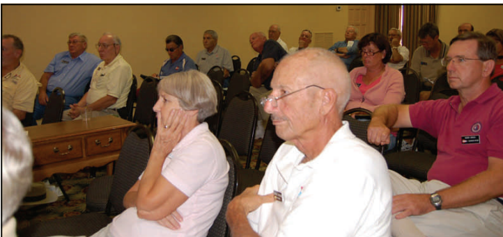
Photos from the District 26 Change of Watch

The holidays will be here soon. I'd like to wish everyone a happy, healthy and safe season.