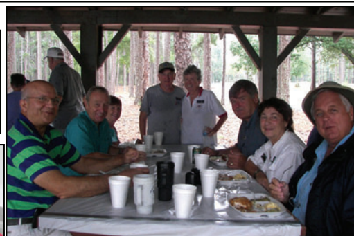
Above: Nourishment, fellowship and lots of smiles.