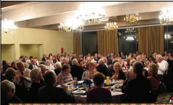
Photos from the District 26 Change of Watch

We are looking forward to the D/26 Spring Conference which is being hosted by Hilton Head. The squadron members are well underway with the planning for this event. It promises to be a fun and educational weekend. See you there.