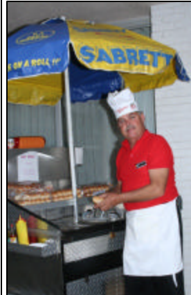
Spring Conference Friday Night March Madness