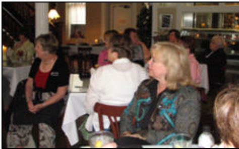
Ladies Luncheon Saturday 29 March 2008