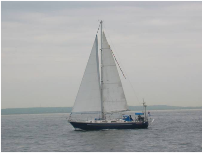
Dream Catcher Coming Home