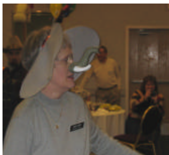
Lead pachyderm in the Elephant Parade