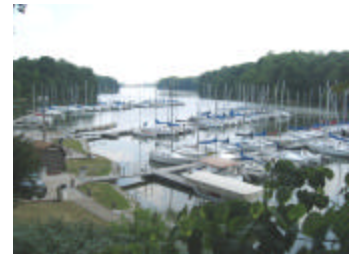
Eagle Creek Sailing Club, Site of New Member Summer Social