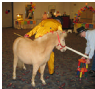
The Pony Performed and Wowed Everyone

The National Association Of State Boating Law Administrators (NASBLA) awarded the Seal of Safe Boating Practices to United States Power Squadrons (USPS) Water Smart From The Start (SM) an "on-line" and CD based game designed to provide an enhanced learning experience for young boaters. www.usps4kids.org