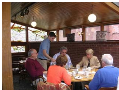
Change of Watch 2008 Good Friends, Good Times, Good Year !!

The opinions expressed by the editorial staff of the Water-Log, or contributors, are their own and do not necessarily reflect the opinions of Lake Candlewood Power Squadron or USPS. Articles may be reprinted without permission, unless copyrighted, by crediting the Lake Candlewood Power Squadron Water-Log. suggestions, jokes, recipes, thoughts etc. with all our members. All Members are invited and encouraged to submit articles for publication in the Water- log. Deadline is the 6 th of the month.