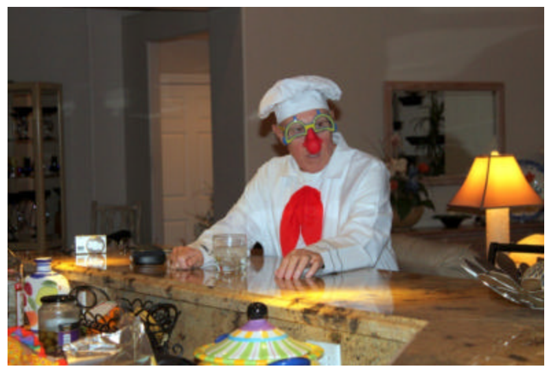
Sometimes I Wonder Why I Keep Doing This