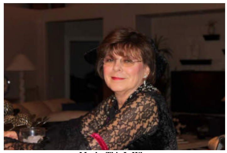
Maybe This Is Why