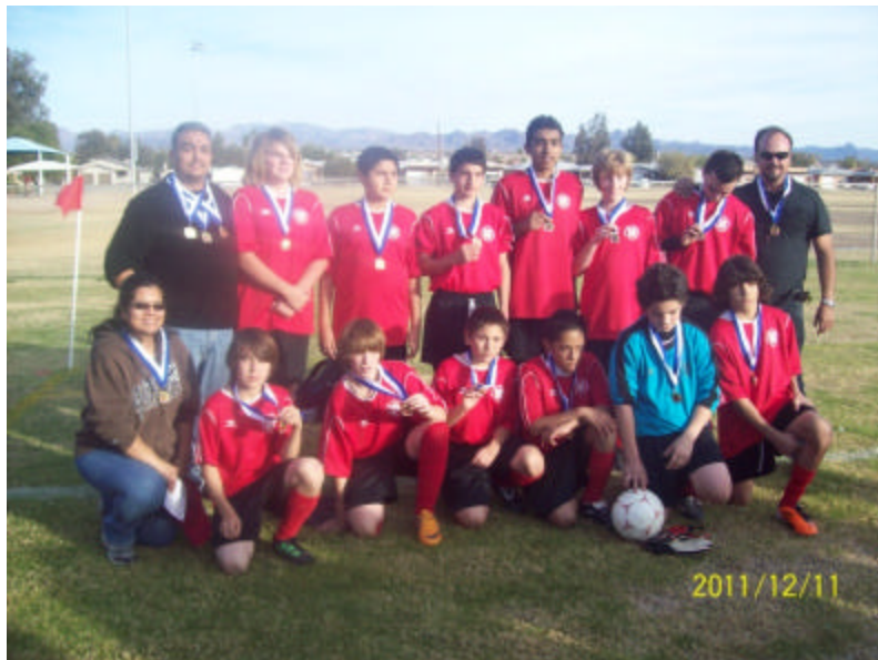
The Bullhead City American Youth Soccer Team