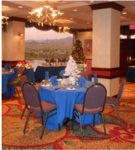
A Beautiful Setting For A Great Party 1