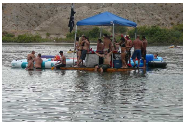
Awwwww, They Look Happy