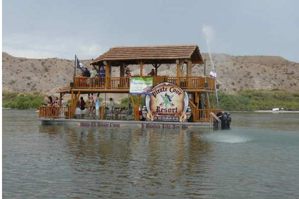
Pirate's Cove Was One Of The Sponsors

The river was calm, the breeze slight and everyone was happy. It truly was a pleasure to be there, to see all the wonderful colors of the floats as they drifted down the river while watching and listening to an estimated 29,000 participants doing what they came for – to experience an awesome float down the Colorado River in Bullhead City's 5 th Annual River Regatta!