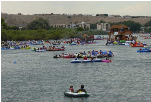
Lots Of People Having Fun, Fun, Fun!