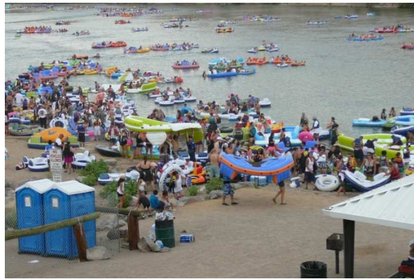
Incredible Display Of The Number Of People