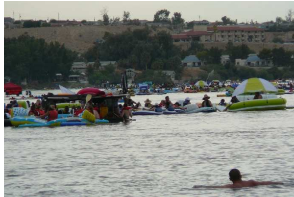
Did He Miss His Float?