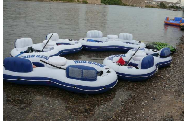
What Ever Happened To Inner Tubes?

The Link below will have some video clips taken at the Regatta: