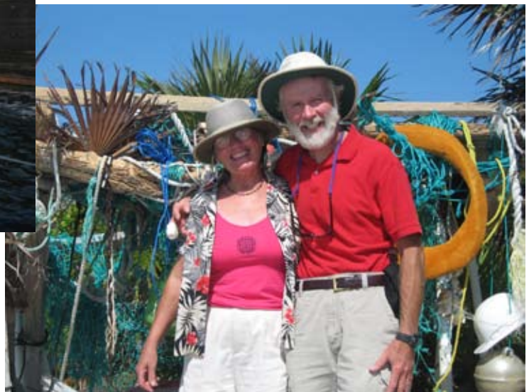
Valentines Day in the Bahamas was a "day at the beach" for us on Thomas Cay, in the Exuma islands group. We also managed to find a special luncheon at the marina in nearby Sampson Cay.