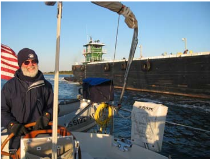
As we passed through North Carolina on the ICW in early November, we were definitely in search of warm weather. This commercial tug and barge helped us out by forcing an early opening at the Wrightsville Beach drawbridge.