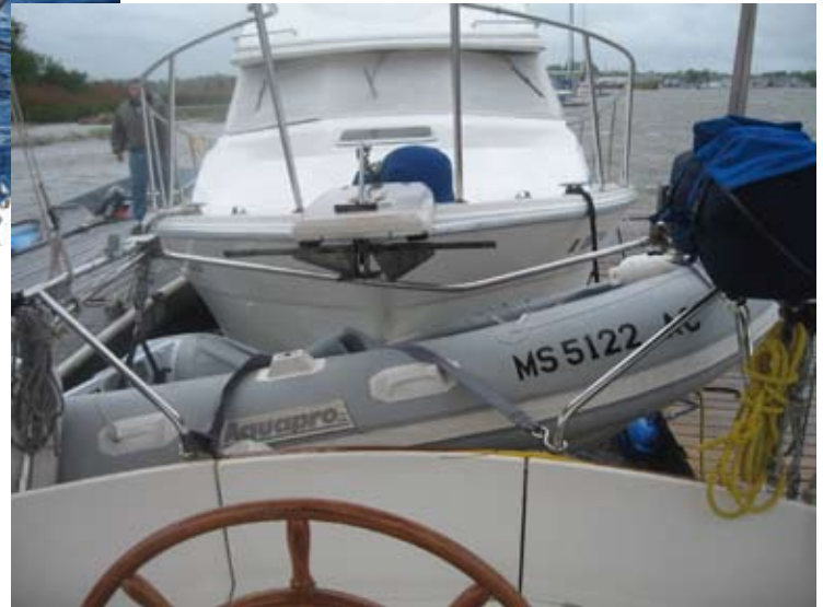
On May 12, in Greenwich, NJ off Delaware Bay, we had our first collision – while tied to a marina fuel dock! A 28-foot power boat broke free during a storm and with no one on board managed to make a perfect landing at our stern. Our inflatable dinghy performed perfectly as an improvised air bag, protecting Sogno, the crew and the power boat!