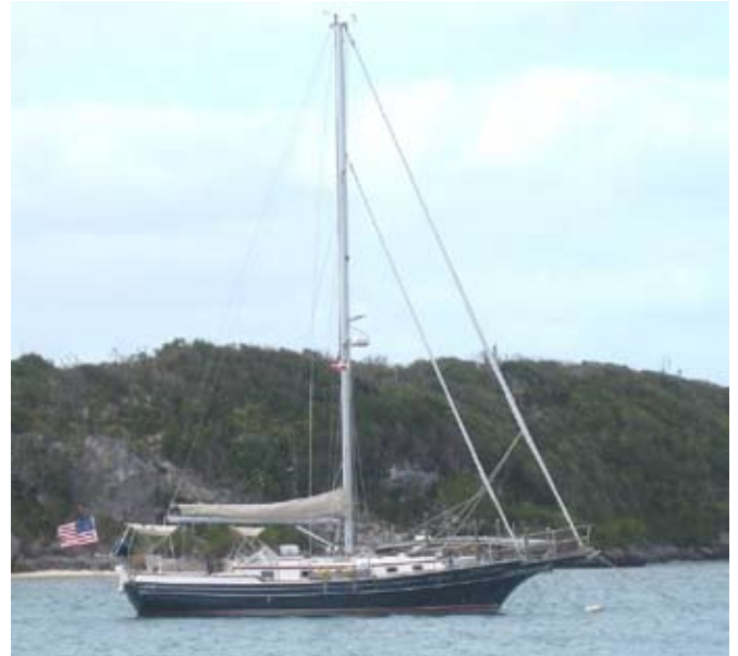
This is Sogno, our Gozzard 37 moored in Little Harbour, Great Abaco Island in the Bahamas. This was a popular cruisers hangout thanks to nearby Pete's Pub.

This is a great opportunity to virtually enjoy a "dream trip" with experienced cruisers, and in the process pick up practical lessons and tips that could benefit any of us greatly on any extended cruise. Pencil in 1/25/09 now on your new calendars to save the date!