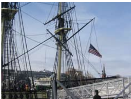
The "Cockbilling" of the lower yard with the ensign at half mast. (piper in the foreground)