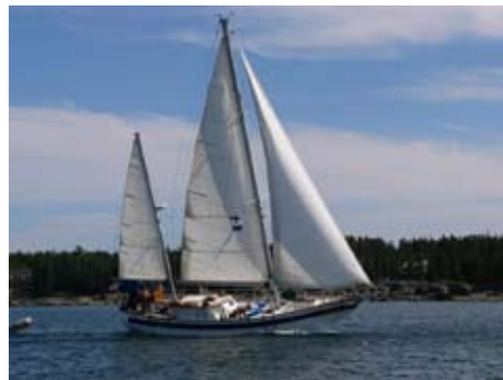
Beausoleil under sail

I highly recommend taking the MSPS courses, even if you have been boating for many years. In addition to the courses mentioned above, I have