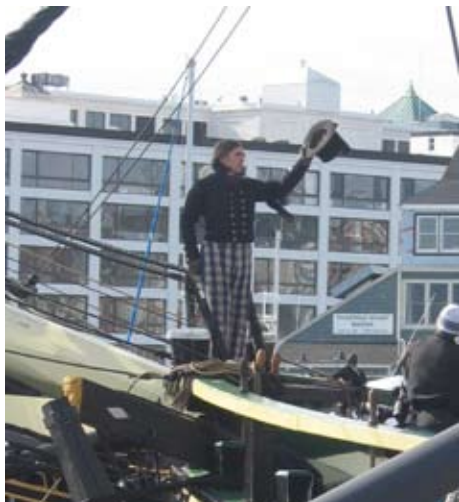
A crew member after playing the fife during the "cockbilling" ceremony.