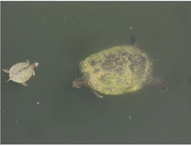
There really are lots of green turtles at Green Turtle Bay Marina.