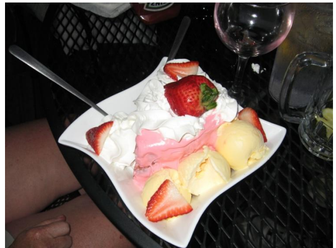
None of us lost weight on the trip! But we all had a great time on our wonderful Tennessee River Adventure.