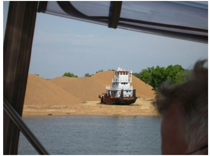
Just resting here? Or retired?