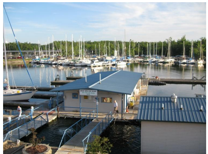
Green Turtle Bay Marina from the hill.