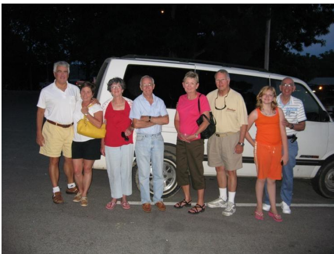
We had a "hair raising" ride to dinner on I-40 in this old van at Cuba Landing Marina.