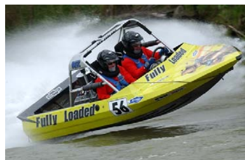
Sprint Boat racing link