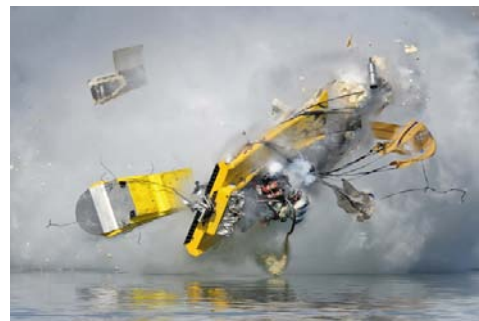
Drag Boat disintegrates. (Driver was ok) link

The AO is next in line of command in the event of absence or incapacity of the commander and executive officer. As is the case for all officers on the Bridge, assigned duties and responsibilities should provide the right background for this officer to progress to positions of more responsibility.