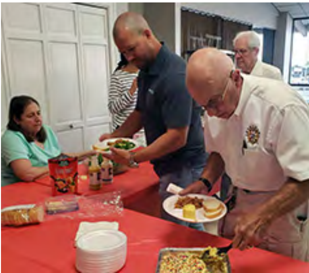
Social before the meeting