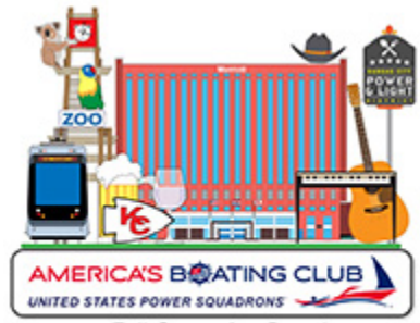
Fall Governing Board August 27 - September 4, 2023 Kansas City, Wissouri

on the Kansas City Governing Board Meeting. The Kansas City Marriott Downtown is ready to accept your reservations! Book at conference rates from Aug. 27 through Sept. 4 and make a vacation out of it! Our Activities Chair is working diligently to provide