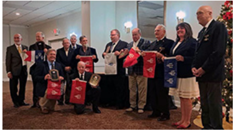
I love new officers fiddling with their flags!