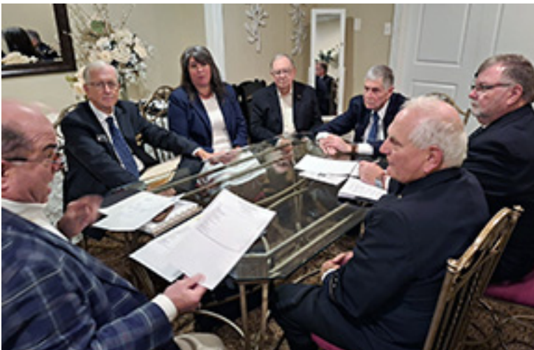
Executive Board Meeting before the Change of Watch.