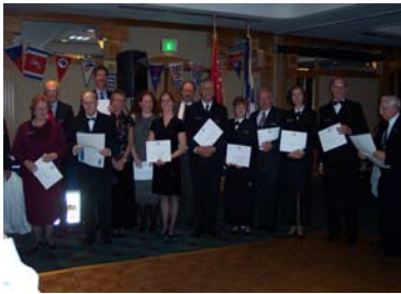
Squadrons receiving awards at Dinner Dance

The District 6 Fall Conference 2004 was held in the beautiful scenic Southern Tier city of Corning in the Radisson Hotel.