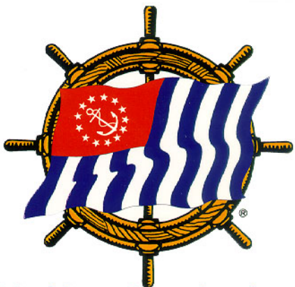
United States Power Squadrons

New members will be billed their renewals on their anniversary date. Current members will continue to be billed in June. The districts (10, 15 and 16) that have participated in the first test have been very happy with it. The program will make dues collection easier for both squadron members and squadron treasurers. It will make it easier to sign up new members. It will make district and education fund payments automatic and payments will be much more timely (every two weeks).