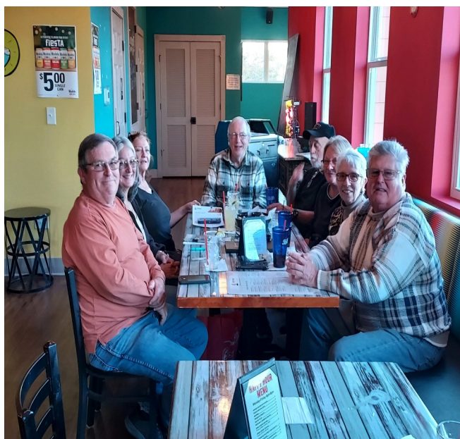
February 21st Happy Hour at Roca Rojas Cantina.