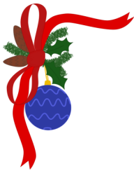
2022 North Strand Christmas Party