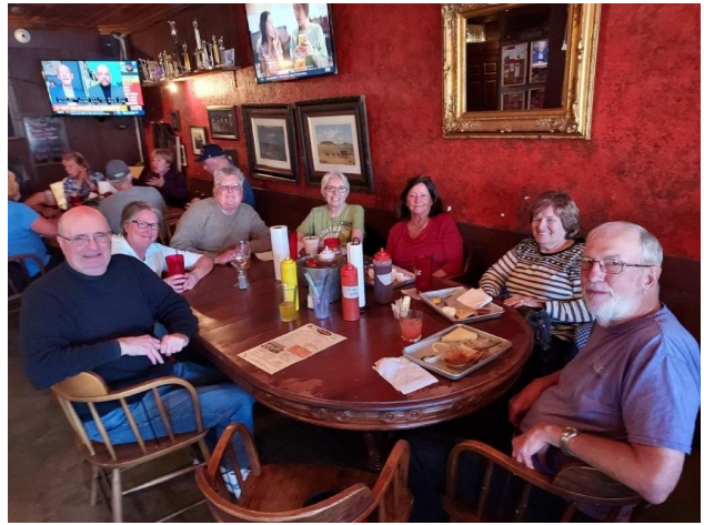
March Happy Hour