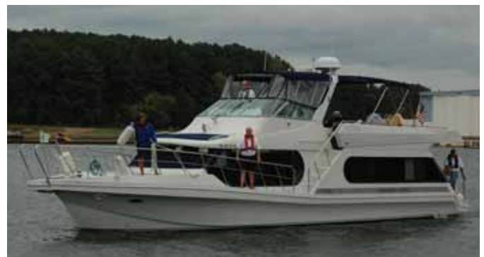
RDREAM leaving the West Basin with crew and Wounded Warriors from the Walter Reed Army Medical Center.