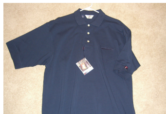
Cutter and Buck Shirt

P/R/C Bob Brandenstein will conduct a Basic Power Boat Handling certification session at the D/7 Rendezvous on Sat 25JUL09 at 10:00AM at Fo0x Chapel Yacht Club. Demonstrating your boat handling skills on the water in a small boat is a necessary step in achieving your Inland Navigator certification. The skill requirements are listed in Section 13 of the Boat Operator certification manual at http://www.usps.org/national/eddept/boc/files/boc_material/boc_manual.pdf . Contact Bob at robert.brandenstein@verizon.net if you wish to participate.