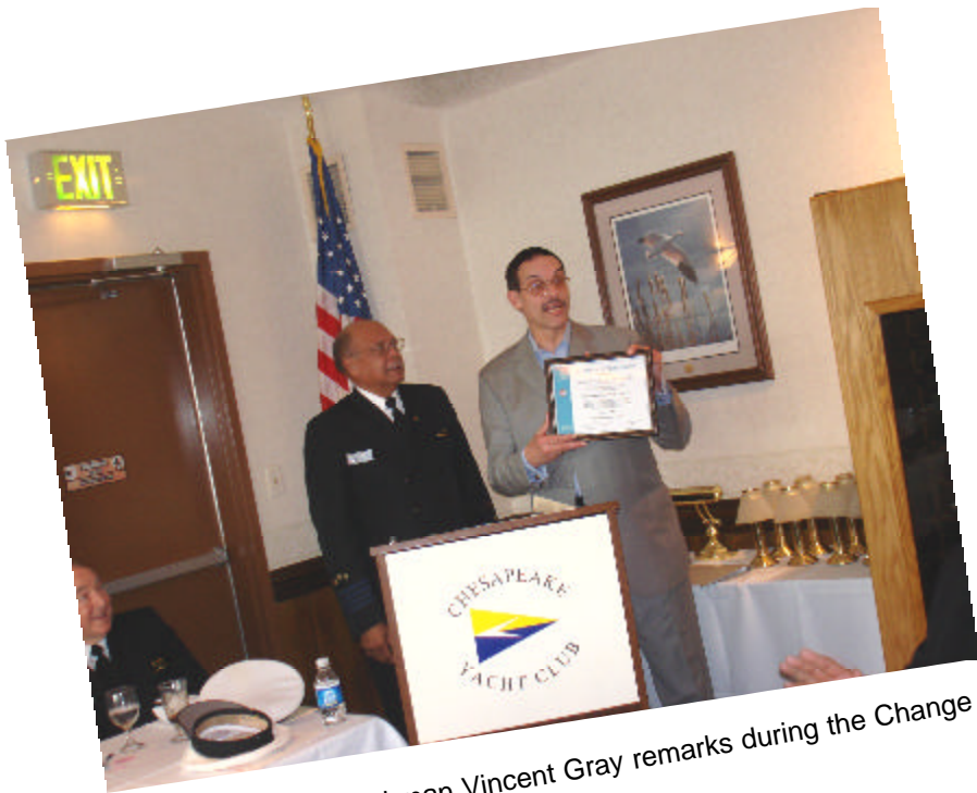
DC City Council Chairman Vincent Gray remarks during the Change of Watch.