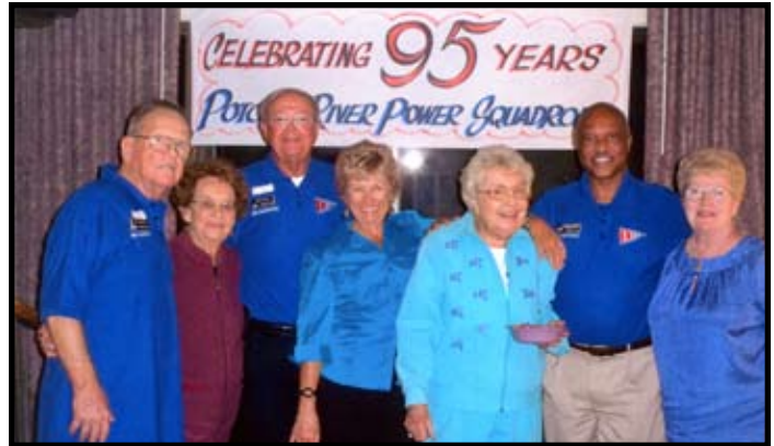
The group celebrates during D/5 Spring Conference.