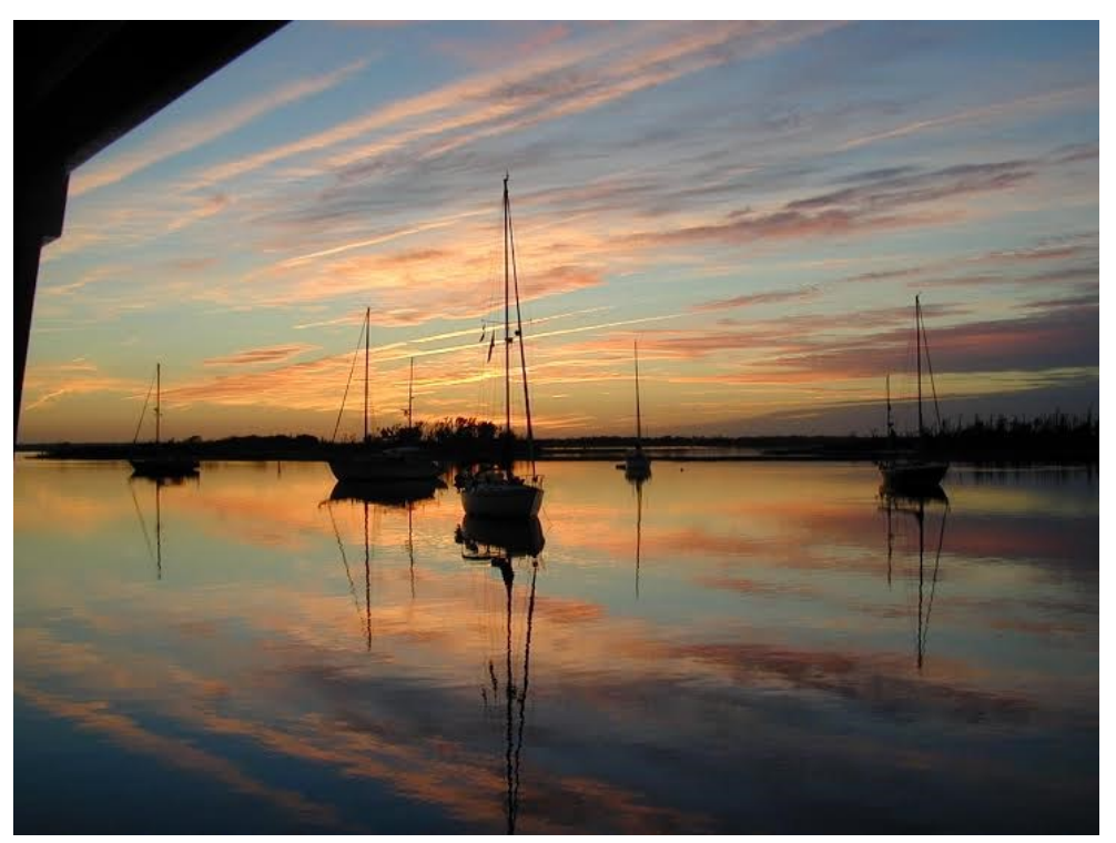
Looking out from the deck of the Aisling during Butch and Lynne Rachal's "Great Loop" trip

MAY - JUNE 2016 Vol. LX, No. 3 Published Bi-Monthly beginning January Website: <u>usps.org/savannahriver</u>