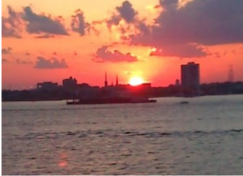
Charleston Sunset from the Yorktown