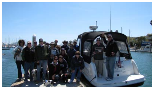
The group at the Blessing of the Fleet

Stormy seas, high winds, possible rain all threatened; but the hardy and hale of Ventura Power Squadron would not be deterred. Fortunately the winds were milder and the sun did shine and although the seas prevented a strong showing of vessels a good time was had by all. The Fleet Review, Commander's Cup and BBQ were enjoyed by thirty-four of us more resilient, not to miss the activities due to a little harsh weather types and a dozen of our four legged friends. Good times commenced as we set up lawn chairs in no particular order on the green grass overlooking the channel next to the dock ramps and watched the occasional ocean going craft glide peacefully past our vantage point. Check out our "group" photo!