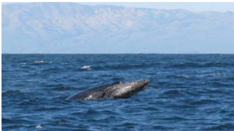
on Island Packers trip!

I passed with flying colors, except for my boat horn. It didn't work, but I had a hand held compressed air horn next to me! Whew! I asked, but they didn't want to hear it work! I was issued a citation of compliance. I asked them if they were buying us lunch since they delayed us by 45 minutes....they said no, however they allowed us to continue on our way. This event alerted me to the significance of having the correct safety equipment on board at all times, and thanks to the Ventura Power Squadron's educational classes, I was spot on.