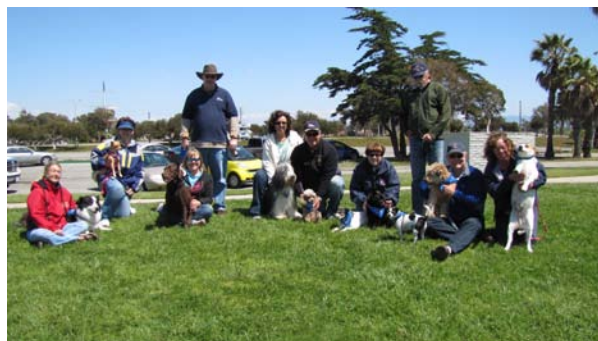
All the VPS dogs in their VPS scarves and their people!