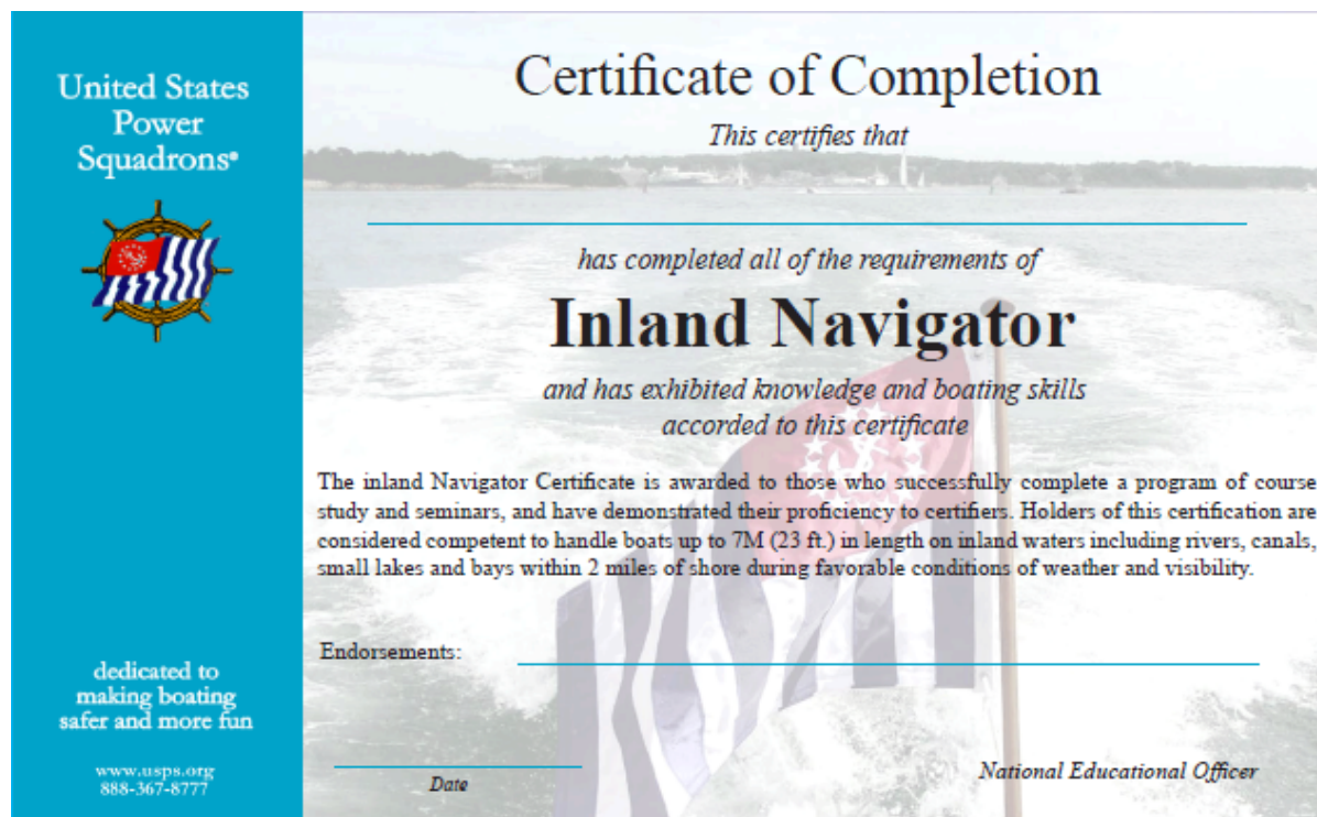
Figure 3. Sample of USPS Inland Navigation Certificate of Completion

Upon completion of all requirements, a certificate will be issued.