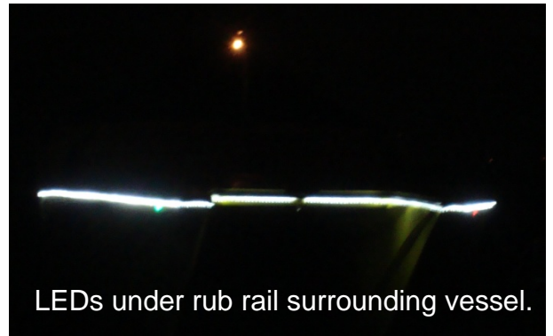
LEDs under rub rail surrounding vessel.

The U.S. Coast Guard is concerned about the sale and availability of unapproved recreational and commercial vessel navigation lights. Purchasers of such lighting should be aware replacement lighting may be improper for its application due to the failure by manufacturers to meet technical certification requirements. Furthermore, technical advances in marine lighting, such as the use of Light Emitting Diodes (LEDs), rope lighting, underwater lighting, and other various types of decorative lighting, may violate navigation light provisions of the Nautical Rules of the Road.