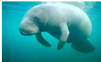
One of Our Friendly Neighbors